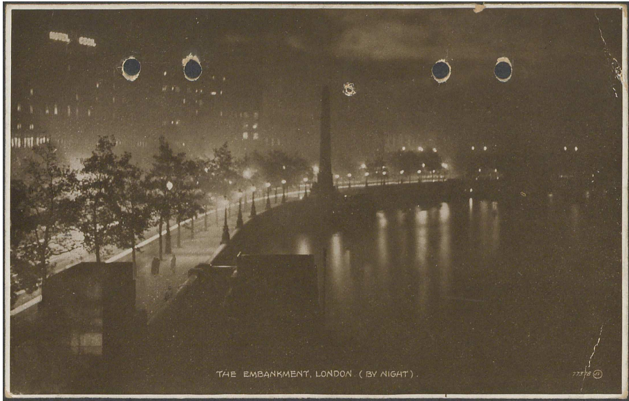
THE EMBANKMENT, LONDON. (BY NIGHT).